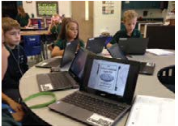
Students in third grade using Chromebooks watching a video on Author's Purpose via Scholastic Core Clicks.