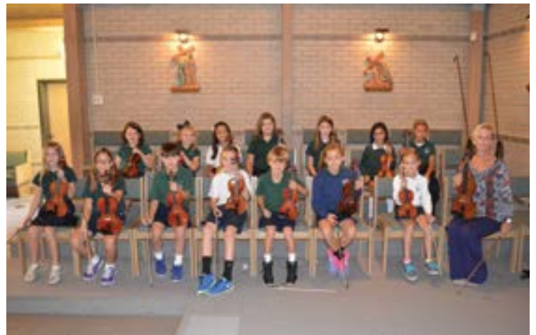
Saint Peter School strings preparing and performing for an all-school Mass