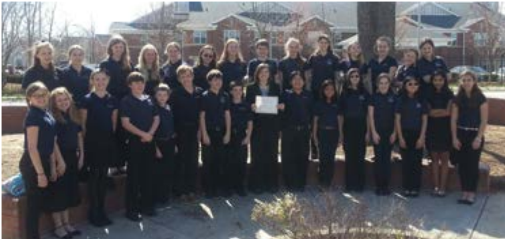
Saint Peter Catholic School Vocal Ensemble