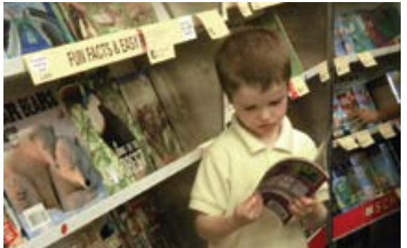
Choosing a book at the Library's Book Fair is serious business...