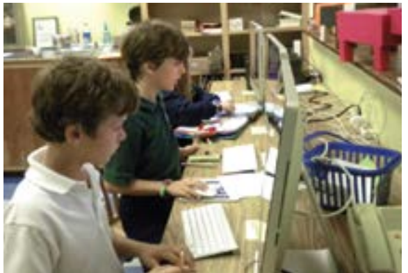
Students work in the Media Center's Mac Lab.