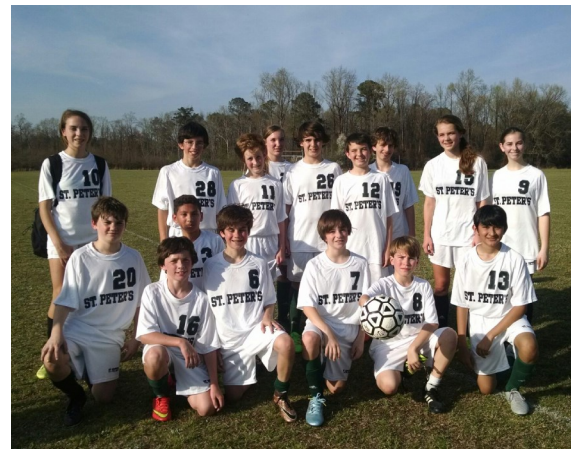
The SPS Soccer team in new uniforms donated by an anonymous donor.

Thank you to all SPS parents-students to helped with JR4H fundraiser, we raised over $4,000 dollars for the American Heart Association. Gifts/rewards for the students are on their way and will be passed out as soon as we receive them.