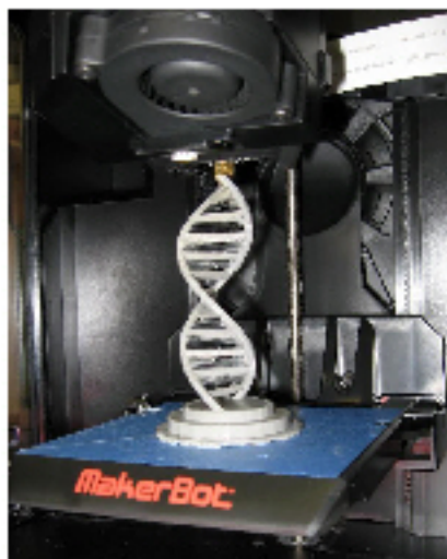
Print in Progress

Three-dimensional (3D) printing is an additive manufacturing process that, in the case of our printer, uses information from a student's computer-aided design file to create a plastic, three-dimensional object. The printer's software interprets a student's CAD drawing as a stack of thin horizontal slices. The printer heats and extrudes (squirts out) strings of melted plastic filament to create each slice. The melted plastic strands of our printer have a diameter of about 0.3 mm. Our students' 3D prints of churches each took from five to six hours to print. The DNA model took about two and a half hours.