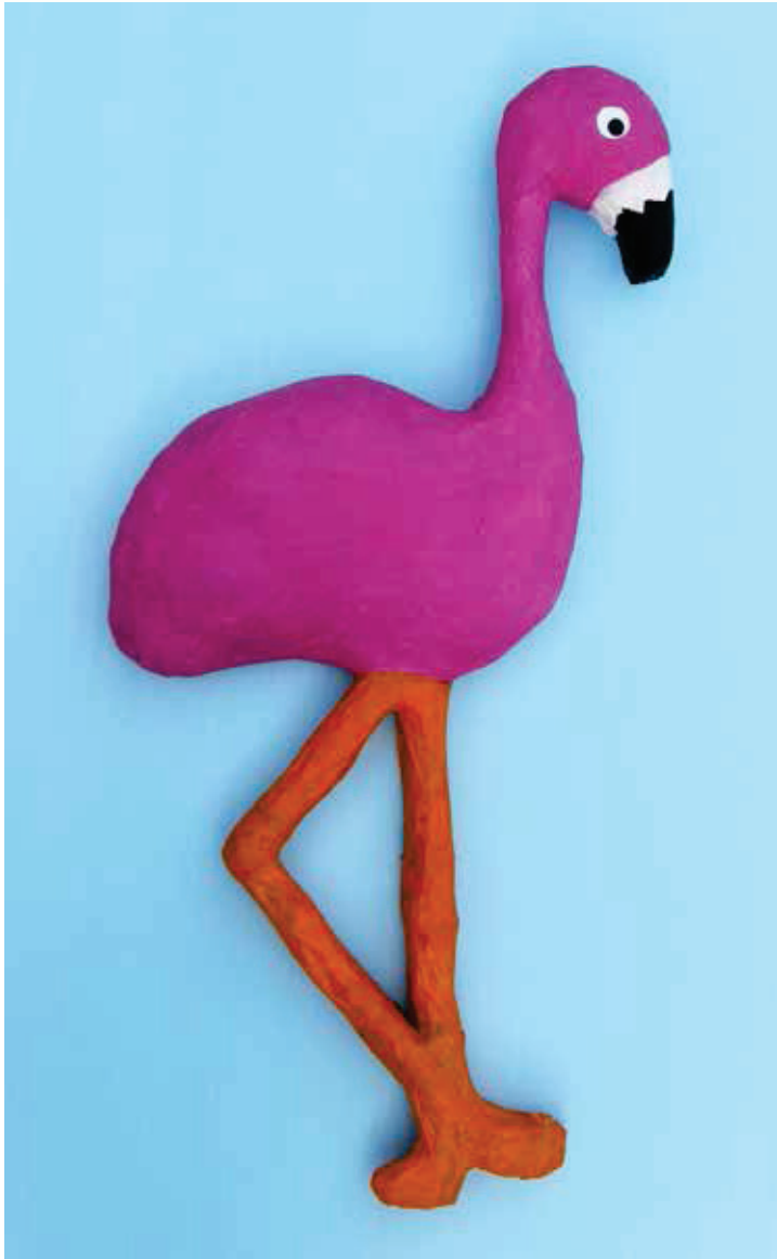
Pink Flamingo by Hallie Mills (8H) Styrofoam, paper, tape, cloth, wire, Tempera paint