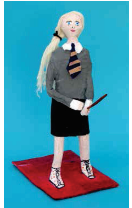
Student Wizard by Kaki Thorell (7L) Wire, paper, tape, yarn, cardboard, cloth, Tempera paint