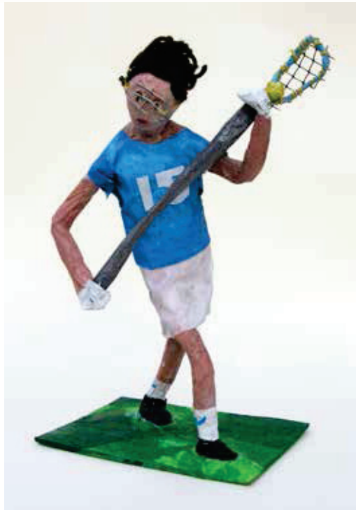
Lacrosse Player by Emma Blake Byrum (7L) Wire, paper, tape, yarn, cardboard, cloth, Tempera paint