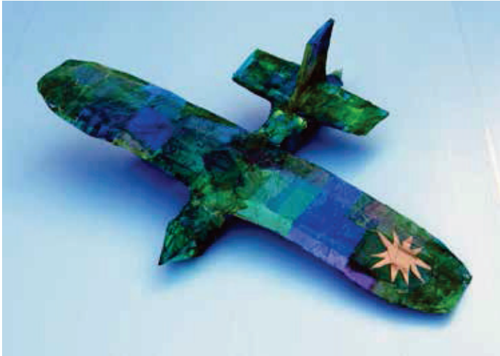
Airplane by Erin Stockwell (3P) Paper, drinking straws, tape, glue, cardboard