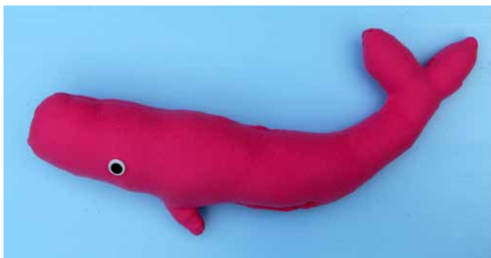
Whale Pillow by Tristen Boykin (8H) Cloth, thread, and poly-fil stuffing