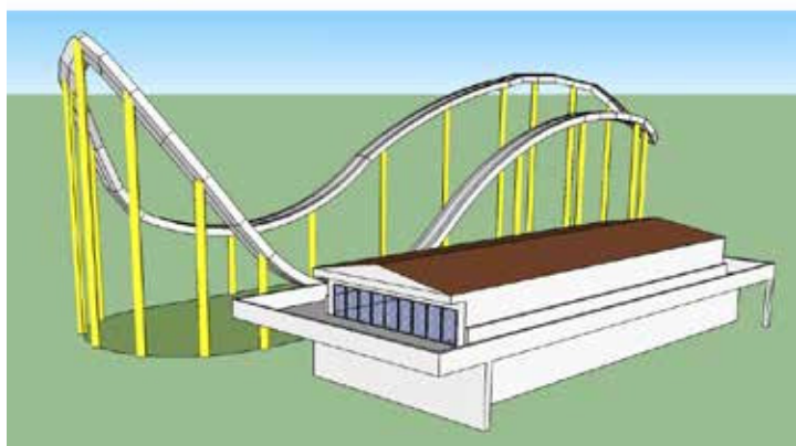
Roller Coaster by Shane Rademacher (7L) Sketch Up Computer-Aided Design Software