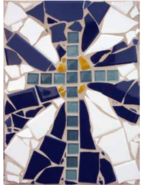
Cross by Ainsley Delbridge (7L) Ceramic and glass mosaic